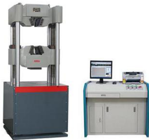
WAW-E Series - Computer Controlled Hydraulic Universal Testing Machine With 4-column and 2-screw structure With Load cell measuring load.