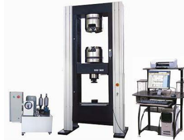
WDW-D Series - Computer Control Electromechanical UTM; Double Column floor type