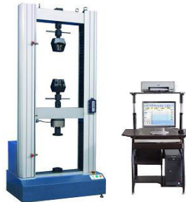
WDW-E Series - Computer Control Electromechanical UTM; Single & Double Column table type