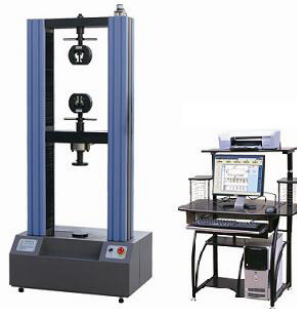
WDW Series - Economical Electromechanical UTM; Single & Double Column table type.