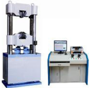
WEW-C Series Computer Display