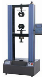
LDW Series - Digital Display Electromechanical UTM; Single & Double Column table type.