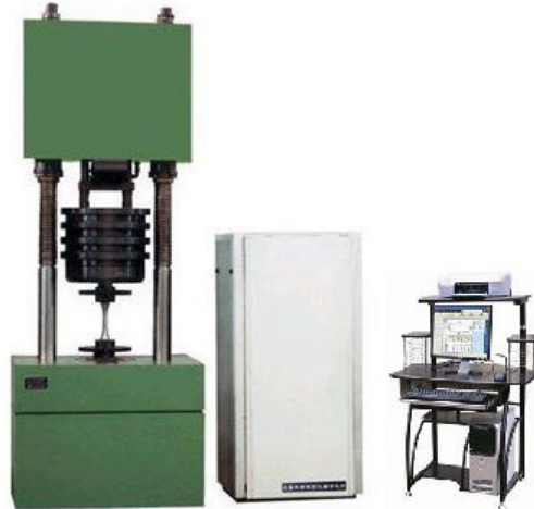
Resonant Fatigue Testing Machine