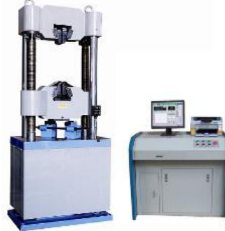
WAW-C Series Computer Control