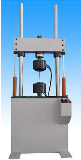
High tech fatigue static and dynamic testing machine for materials and components